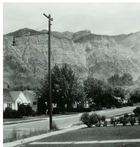
The view from our home in Ogden