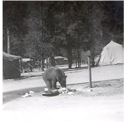
The bear that came to breakfast

Just after Cindee was born we went to Yellowstone Park with Cecil and Claris Toner and their kids, we even camped out that time. We were cooking breakfast over some kind of grill, Cecil was cooking bacon and hot cakes or something that smelled really good. Good enough to attract a big old bear. As he came toward us, I grabbed my kids and put them in the car. That old bear came right up to our table, Cecil hit him on the nose with the