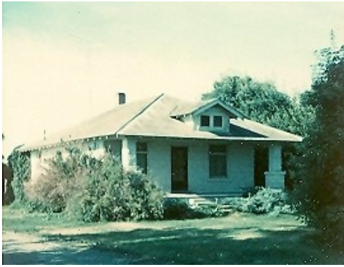
The Hitt place (500 S 100W)

In the fall of 1958 we bought the Hitt Farm just a mile south of where we were living. We moved into the house and Gordon got the fall work done and was all ready for spring. During the winter the deal fell through. So we had to move again. This time to the Story farm, still in Pella on the same road as the Gee place. It was a tall two story house the kids always called the "Gick