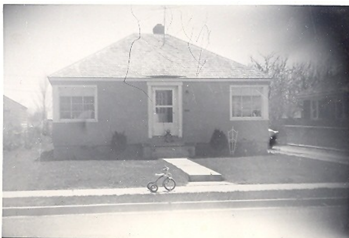
Our home in Ogden