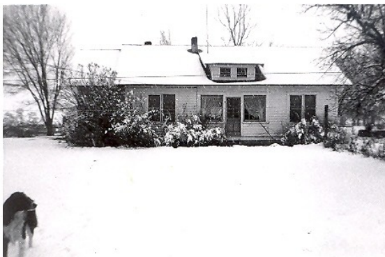
The Buttars place (100 S 50 E)