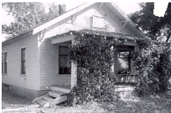
Our home on the Gee place (510 S 150 E)