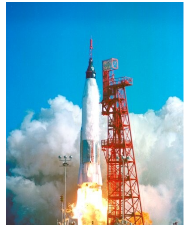
The launch of Friendship 7 and John Glenn

Television was just coming of age. For better or worse, it was the world's most powerful, influential and immediate medium of mass communication. Television enabled people across the globe to witness events as they happened. We are able to watch all these amazing history making events take place right from our living room. In 1962 we watched John Glenn circle the earth three times. It was so awesome to see these space flights take off into outer space and to land again.