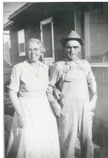
Mother and Daddy - 1957