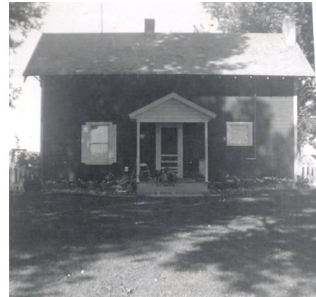
The Story place (550 S 150 E)

There was an old chimney on the north side of the house. It wasn't used for anything except a beehive. One day I had sprayed the house for flies and we all went out on the lawn while the fumes cleared. The kitchen window next to the chimney was open a crack. The spray made the bees sick and a we were attacked by a swarm of mad bees. Everyone was stung but Gordy.