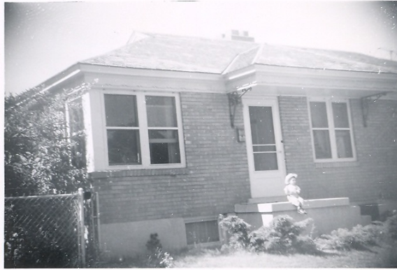
Our home in Salt Lake