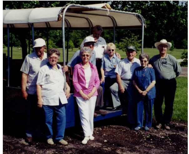
Tour wagon in Nauvoo