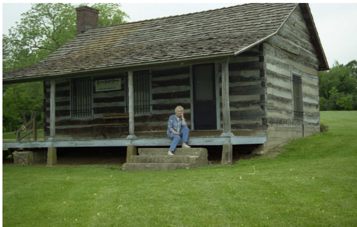
Someone's dream home once upon a time.