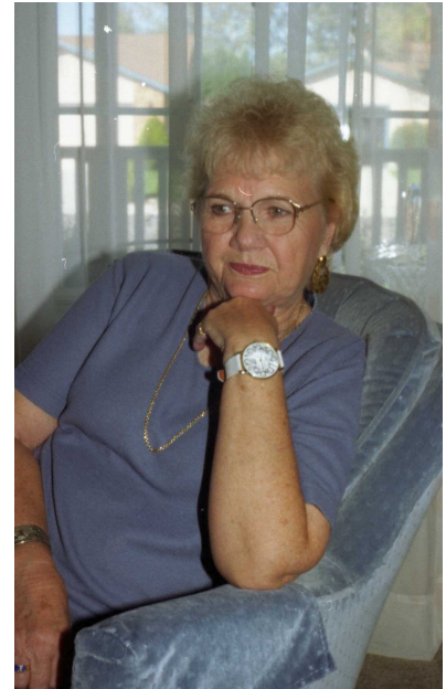
75 years young