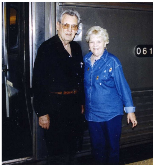
Boarding the train