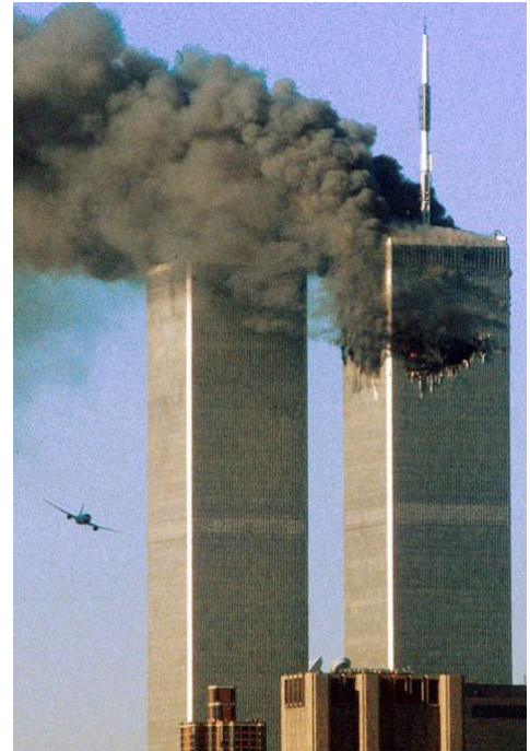
The World Trade Center

Terror and Tears! On Tuesday, September 11, 2001 our great nation experienced the worse disaster in our nation's history. A day America will never forget. Terrorists struck across the East Coast that morning. At about 8:45 am EDT (6:45am MDT) the first hijacked jetliner crashed into the north tower of the one hundred ten story World Trade Center in New York City, starting fires as the horrified nation watched on television. Eighteen minutes later, a second jetliner appeared low in the sky over New York City and slammed into the south tower, erupting in fire and smoke. Subsequent explosions caused both towers to collapse. A third hijacked jetliner hit and severely damaged the Pentagon across the Potomac River from Washington D.C. A hijacked United Airlines jet crashed outside of Pittsburgh. The passengers in all four planes were killed in an unprecedented, coordinated terrorist assault.