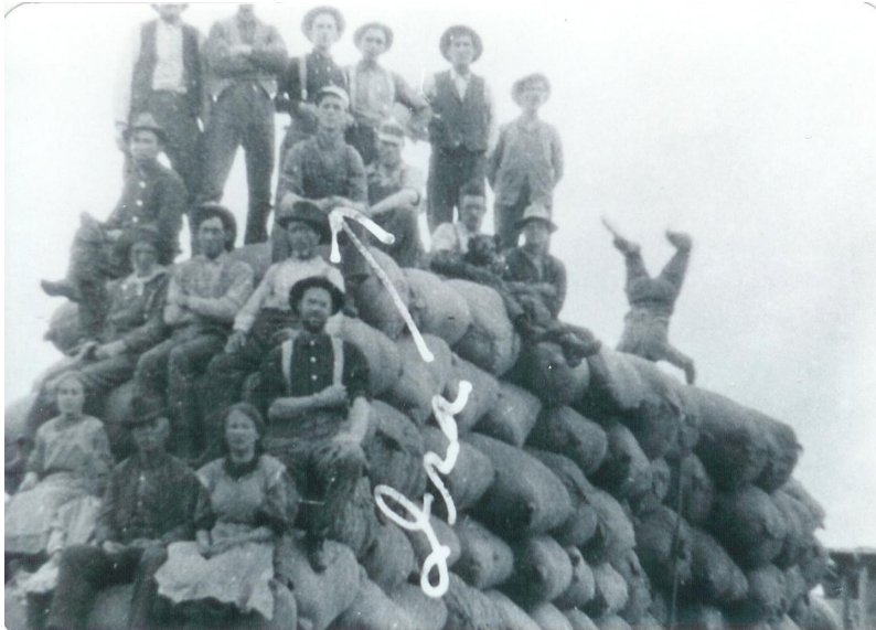
The sheering crew on a wagon load of wool sacks.