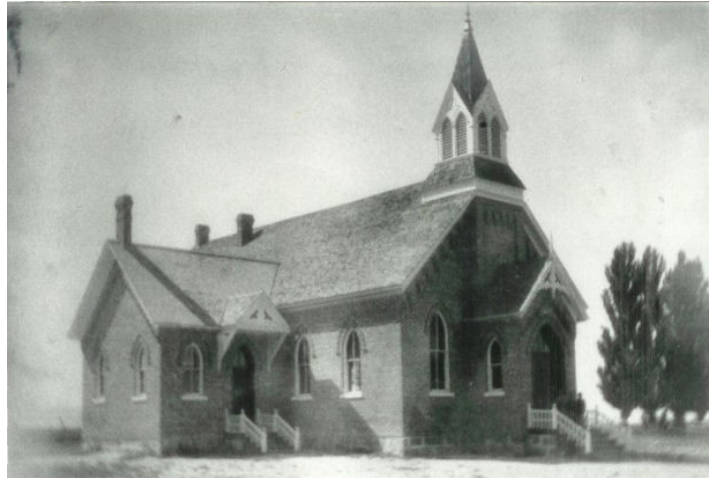
The old Marion LDS Church