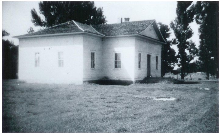
The old Unity Ward Meetinghouse