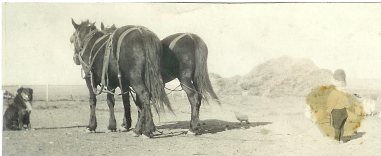
Old Short - the Dog, a team of horse's, a chicken, and Myron

Money was scarce, as it was the beginning of the big depression due to the crash of 1929. Nevertheless, Ira managed to keep food on the table and was ready in the spring to farm the new place, which consisted of forty acres just below the first lift canal. There was also about sixty acres of pasture land next to the river, separated from the rest of the farm by the highway.