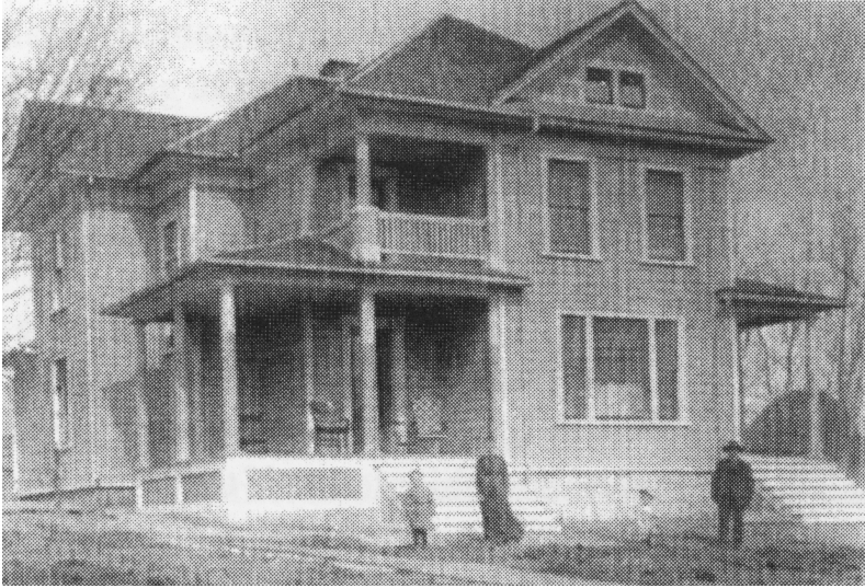
Illustration 1: Emma and Daniel's new home

horse drawn wagons. The rocks for the foundation were hauled from the surrounding area. The house was completed in 1907 and the family moved in for Christmas.