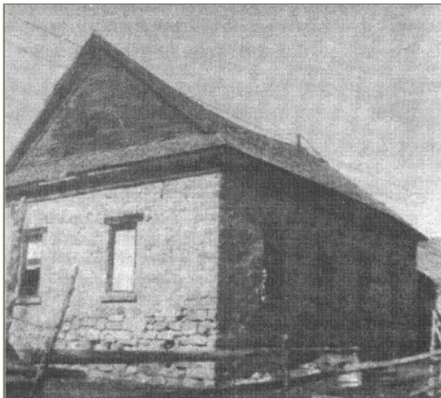
The old Clarkston Schoolhouse

husband and daughter also moved to Clarkston.